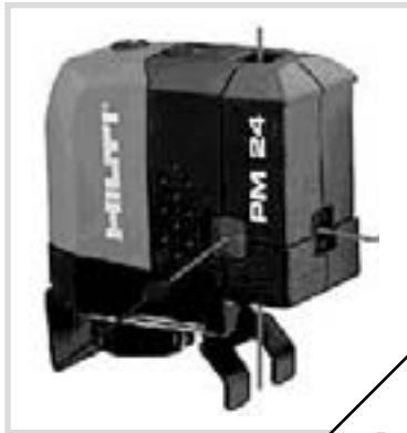
Hilti Laser24 #HL24

So now when you purchase a select Hilti rotary hammer, combihammer, breaker, diamond coring system, laser positioning system, or ferrosan product you will receive, at no additional charge, a 2 year worry-free warranty. This means your tool will be serviced quickly and reliably with no additional cost to you during the full service warranty period. Call a Hilti Customer Service Specialist at (800) 879-8000 to learn more about this offer by Hilti to provide excellent service after the sale!