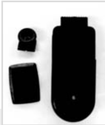
Universal Mobile Clip