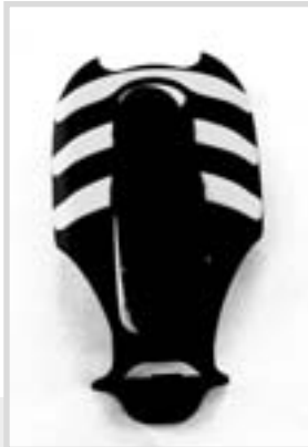
Nextel® i530 Rubberized