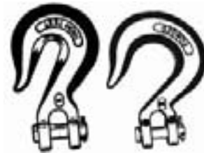
Clevis grab Hook