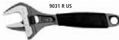
9031 R US